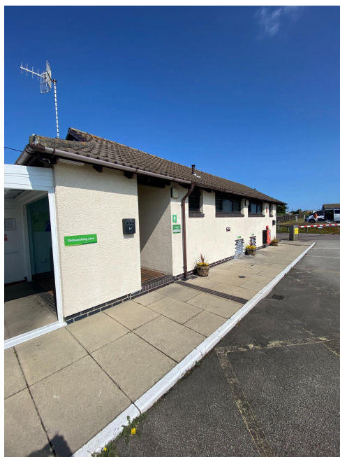
Beach Side Toilet Block