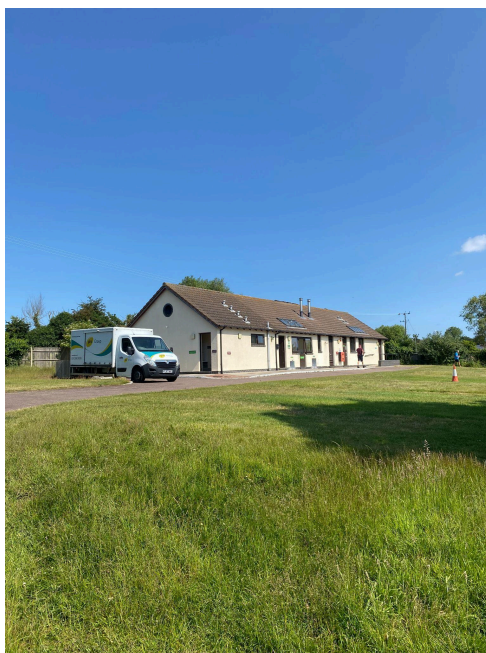
Main Toilet Block