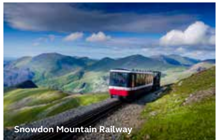
Snowdon Mountain Railway