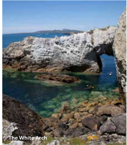
The White Arch

The nearest National Cycle Network route to this site is route number 5, Bangor to Conwy.