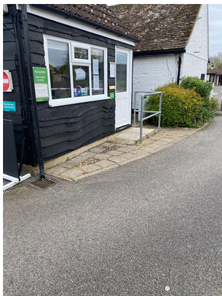
Entrance to Reception