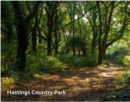
Hastings Country Park