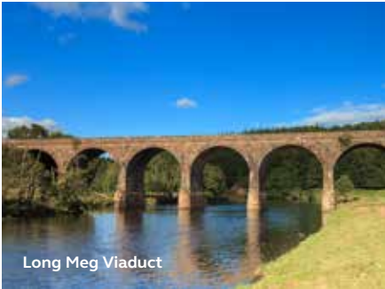
Long Meg Viaduct