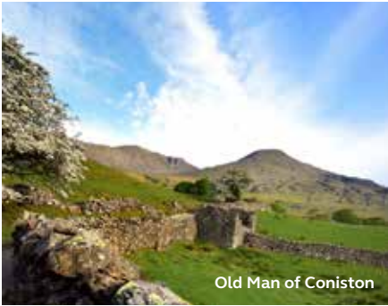
Old Man of Coniston