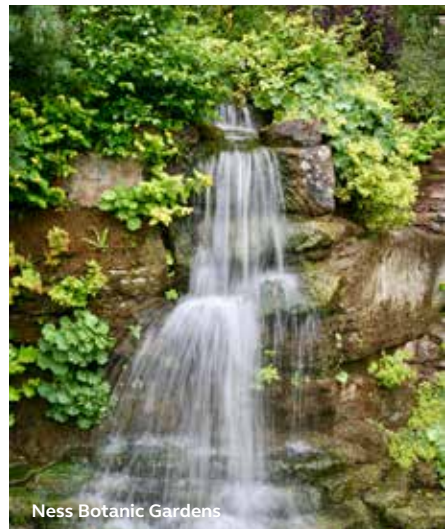
Ness Botanic Gardens