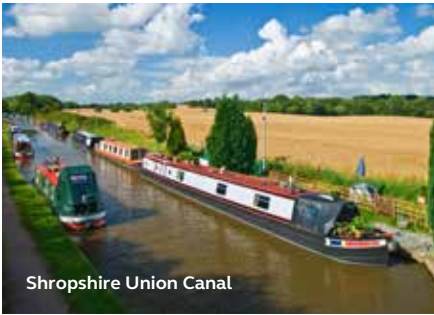
Shropshire Union Canal