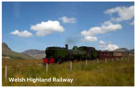
Welsh Highland Railway