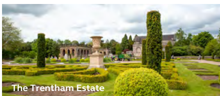
The Trentham Estate

Don't forget to check your Great Saving Guide for all the latest offers on attractions throughout the UK.